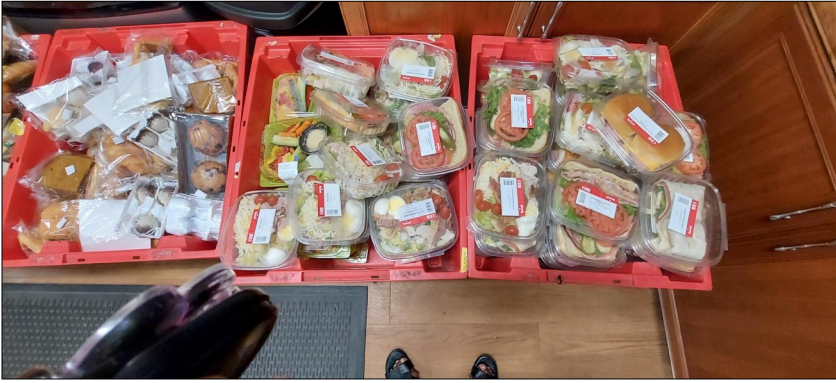
Each Friday we pick up packaged sandwiches and desserts, courtesy of HM Hosts.