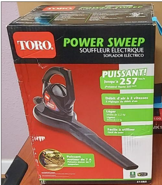
Donation for August Give-A-Way Raffle at Cleone's Closet Food Pantry