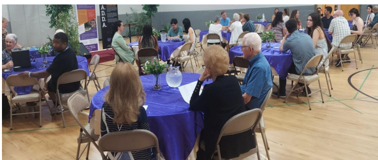
WHEN Staff, Volunteers, Parents and Guests