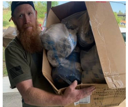
Residents of Ascenda receive donations from WHEN Give-A-Way Program